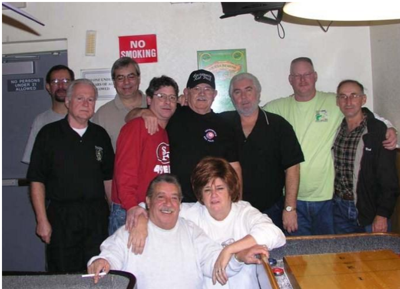
Round Robin weekend at the 133 Club