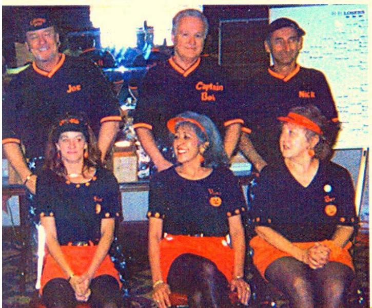
The Halloweenies – NASC 6 person team