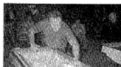
Ed Graves shows the stuff that earned him second place and $6,000.