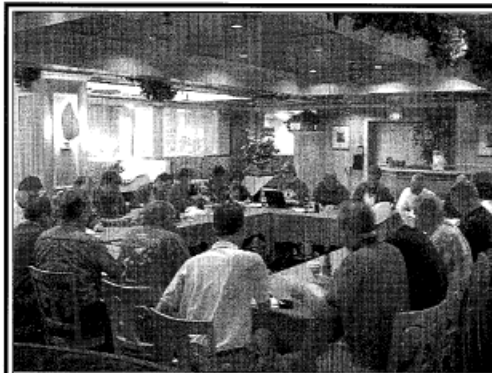
(Above) Captains (and staff) in 6-Person Team Draft Room