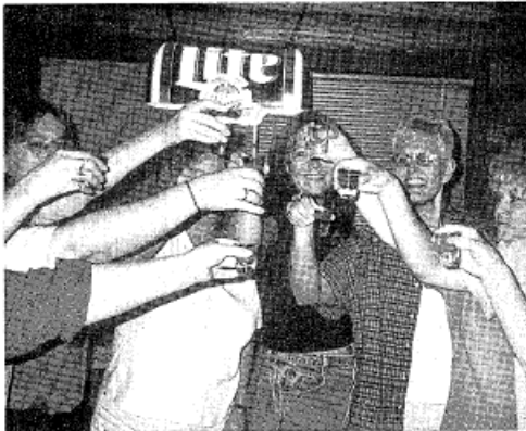
The ladies toast some great shuffleboard and a great time!