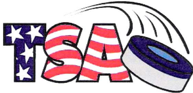
Table Shuffleboard Association, Inc.