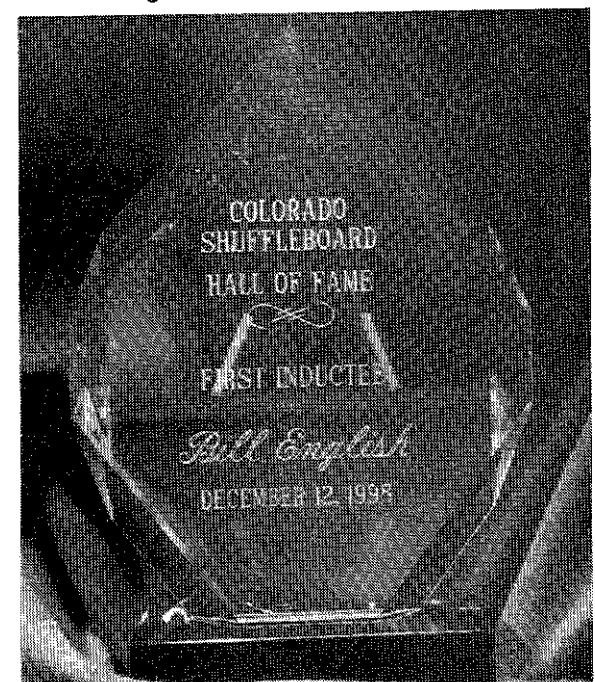
The beautiful crystal and marble plaque recognizes Bill English as the first inductee into the Colorado Shuffleboard Hall of Fame.