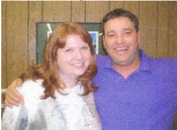
2nd Combined rating of 6