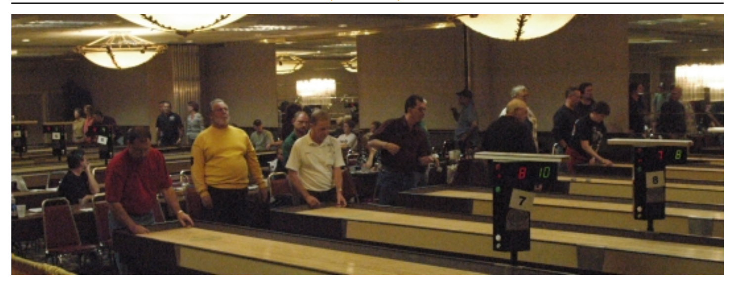
A field of international shuffleboard players filled all 24 boards at the Sands/Regency Hotel & Casino Saturday as a 6-person draft team event kicked off the 15th annual North American Shuffleboard Championships. Twenty-six teams competed in the first tournament of the more than week-long event.