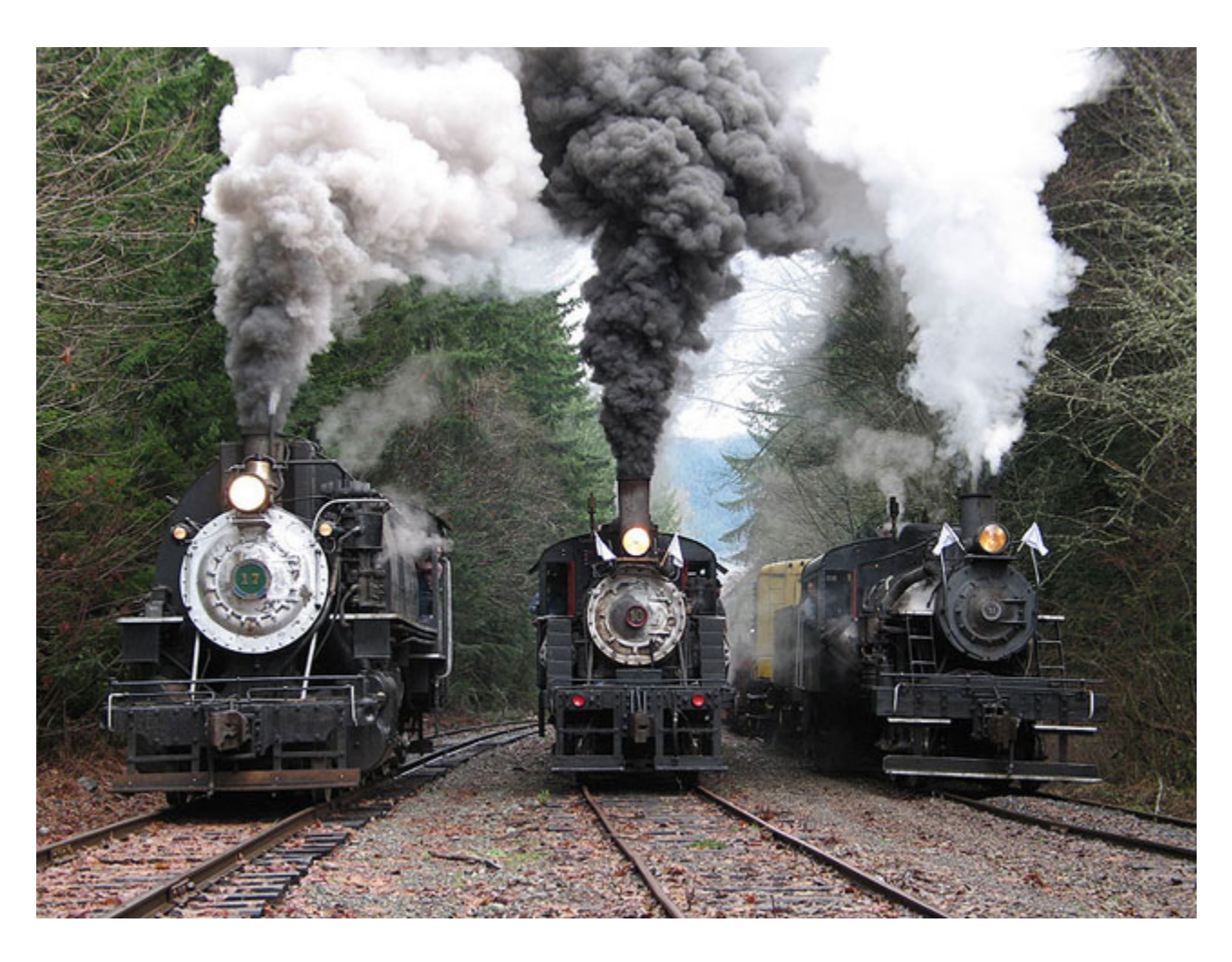
Mt. Rainier Scenic Railroad