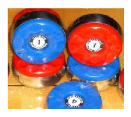
Order a set of Olympic Shuffleboard Weights $250.00 + shipping

Phone: 360-427-6770 Email: olympicshuff@comcast.net Website: http://www.olympicshuffleboard.com