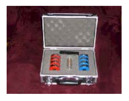
Order a set of Olympic Shuffleboard Weights & Weight Case $295.00 + shipping

Tested and accepted by the pros! Olympic Shuffleboard© Weights