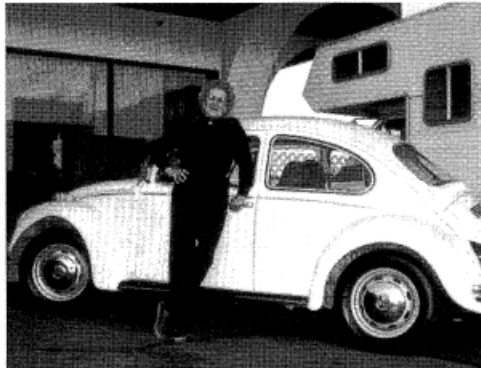
It was "written in the pucks" that this would be a weekend Bea Gilman would not forget. After the honor of the Hall of Fame induction, she was the lucky winner of the classic car!

We all waited anxiously for the drawing for a 1970 VW Classic "Bug" -- very generous along with the $1000 added money for tournament play!