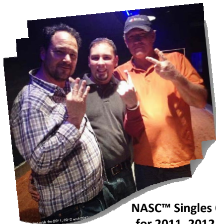
NASC™ Singles Champions for 2011, 2012, and 2013