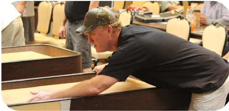
TABLE SHUFFLEBOARD ASSOCIATION